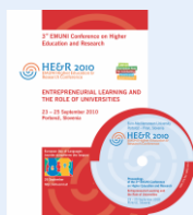
3 rd HE&R Proceedings