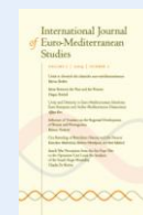
IJEMS Vol 2 | No 2