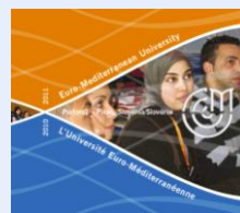
Info Booklet 2010/2011